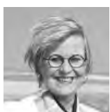
MICHELLE BLOM Director General Ministry of Infrastructure and the Environment - The Netherlands